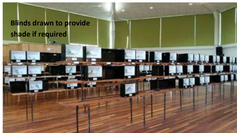
Blinds drawn to provide shade if required