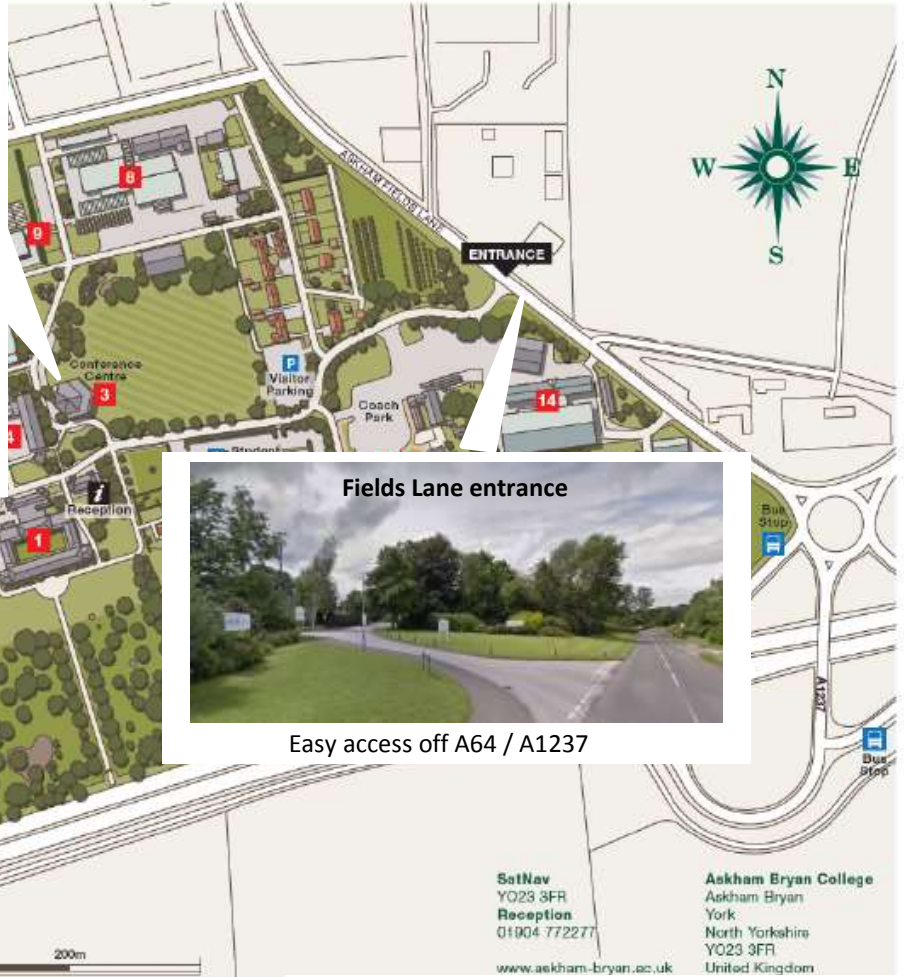
Fields Lane entrance