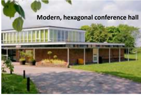
Modern, hexagonal conference hall