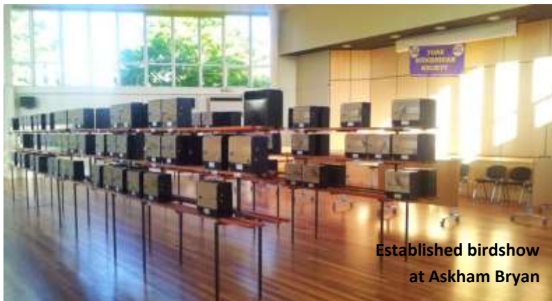
Established birdshow at Askham Bryan